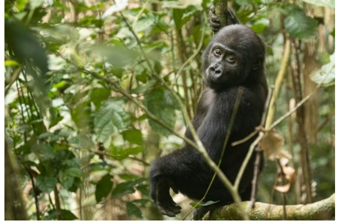
Mbindjo, 2 years and 2 months later.