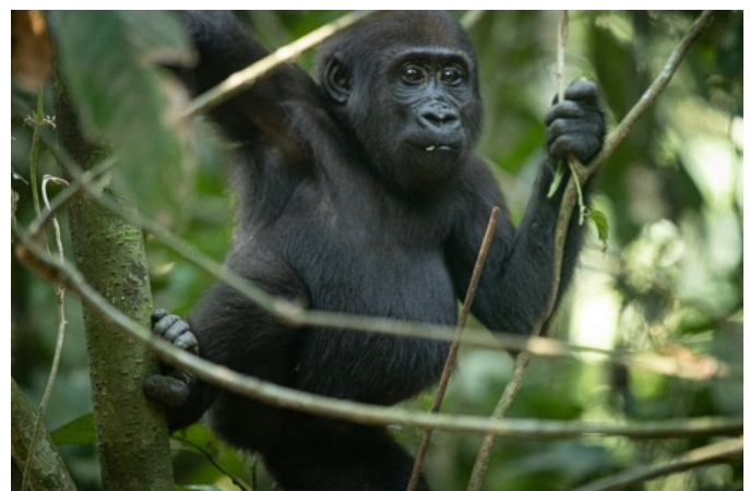
Ngumu 2 years and 4 months later

As the presence of COVID-19 here in the park has already been confirmed, even more precautions have been taken with the aim of keeping the gorillas safe, although we have considered it necessary to still keep up with their observation as it has been deemed more dangerous for them if following were to stop completely for what could be several months.